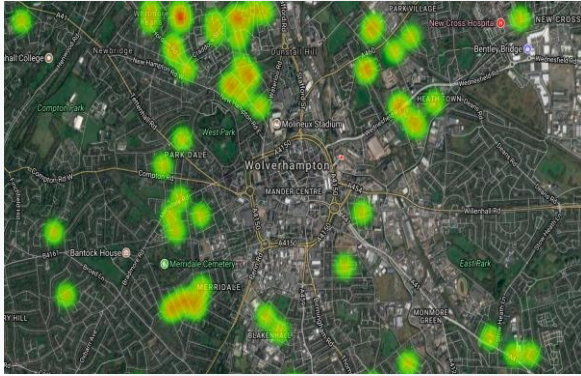
Supporting Cleaner Cities