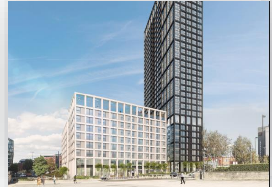
Reducing Private Car Use