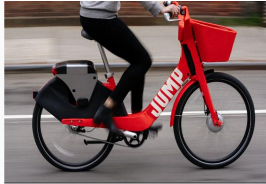
Increasing multimodal travel